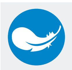
Improved ergonomics and functionality