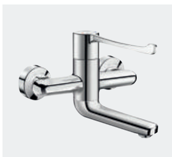
Wall-mounted sequential mechanical mixer, swivelling/fixed spout L. 120mm Ref. DELABIE: 2640

Images available on our website delabie.com , in the PRESS section