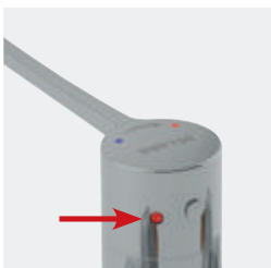
Thermal shock function