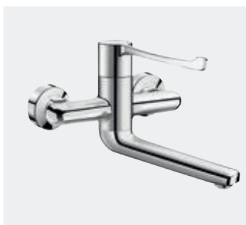
Wall-mounted sequential mechanical mixer, swivelling/fixed spout L. 200mm Ref. DELABIE: 2641