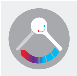
Sequential open and closing

The only wall-mounted sequential mixer which allows thermal shocks without removing the control lever