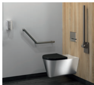
Installation example: drop-down support rail Ref. 511964C