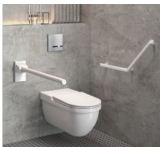
Installation example: drop-down support rail Ref. 511964W

Available in two powder-coated aluminium finishes - matte white or metallised anthracite - Be-Line® ensures a good visual contrast between the colour of the support rails and the wall.