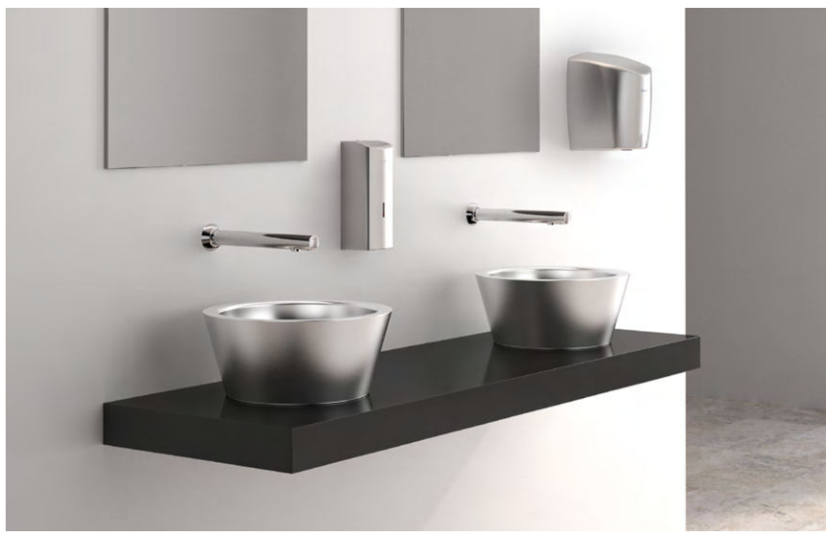
DELABIE ref.: 379ENCL

DELABIE, the European leader in water controls and sanitary ware for public places, expands its BINOPTIC range with a new 252mm wall-mounted spout. This innovation offers even greater flexibility for the design of public washrooms.