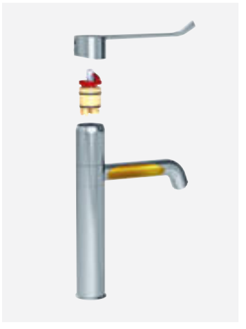
Mechanical basin mixer with swivelling spout Ref. DELABIE: 2564T1