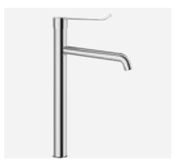
Mechanical sink mixer with swivelling spout Ref. DELABIE: 2564T4