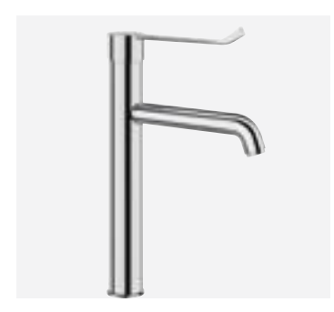
Mechanical basin mixer with pressure balancing and fixed spout Ref. DELABIE: 2565T5EP