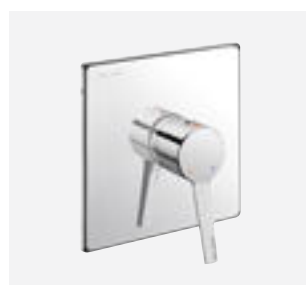
Recessed mechanical shower mixer Ref. DELABIE: 2541 + 254BOX