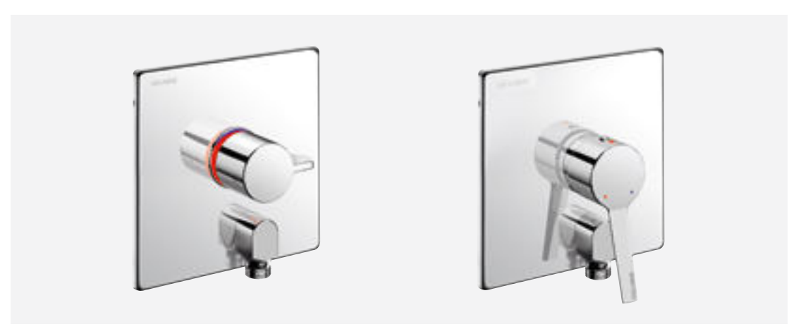
Refs. H9633 and 2551

DELABIE has redesigned its recessed shower mixers by equipping them with a new 100% waterproof recessing housing. This innovative system adapts to multiple installation configurations. They are designed to contribute to patient safety, the prevention of nosocomial infections and to general comfort.