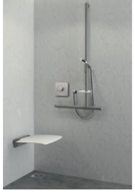
Lifestyle image: shower with H9631 mixer Ref. DELABIE: DOUCHE H9631