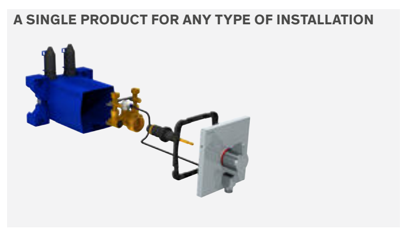
Recessed shower mixer Ref. DELABIE: H96CBOX + H9633