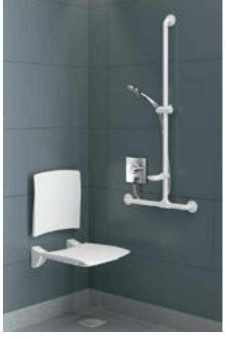
Lifestyle image: shower with H9633 mixer Ref. DELABIE: DOUCHE HÉBERGEMENT H9633