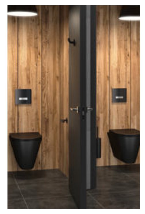
Installation example Ref. DELABIE: WC TEMPOFLUX 3