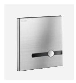
TEMPOMATIC dual control Ref. DELABIE: 464SBOX-464000 or 464PBOX-464006