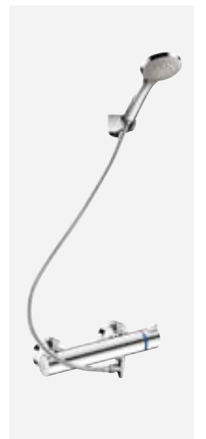
Shower kit with auto-draining device Ref. DELABIE: H9768HYG