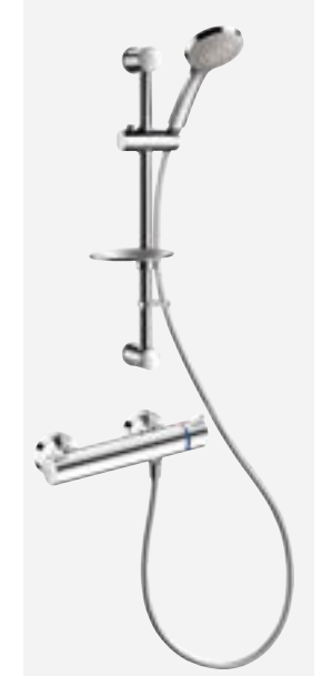
Shower kit with riser rail Ref. DELABIE: H9768KIT