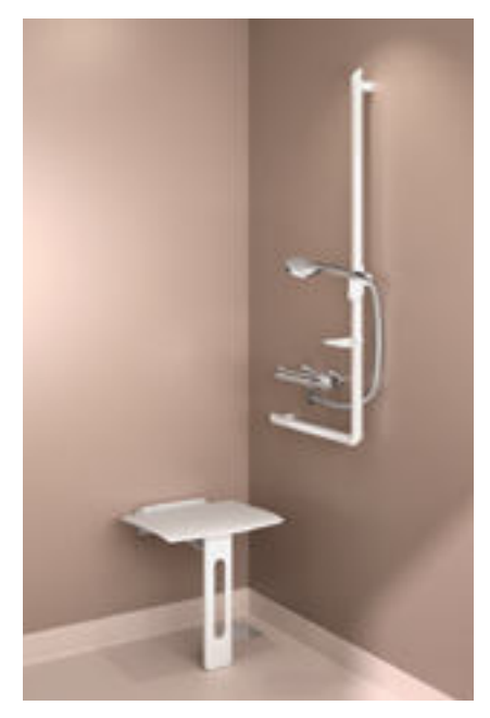
Lifestyle image: shower with H9768TP mixer Ref. DELABIE: DOUCHE HÉBERGEMENT H9768TP